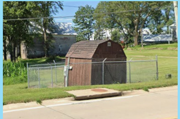
Current Eastgate Lift Station on East Bremer Avenue

The new lift station will be located further off of the road. It will include a precast concrete wet well and valve vault, outdoor electrical and control panels, and a diesel backup generator. Added features, such as security fencing, lighting, a bypass pump connection, and maintenance equipment will make the site safer and easier to service.