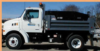
Single Axle Truck 6 cubic yards - $30