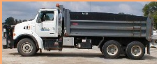
Tandem Truck 12 cubic yards - $35