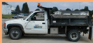
One-ton Truck 3 cubic yards - $25

One cubic yard of mulch covers an area of approximately 100 square feet at 3 inches thick.