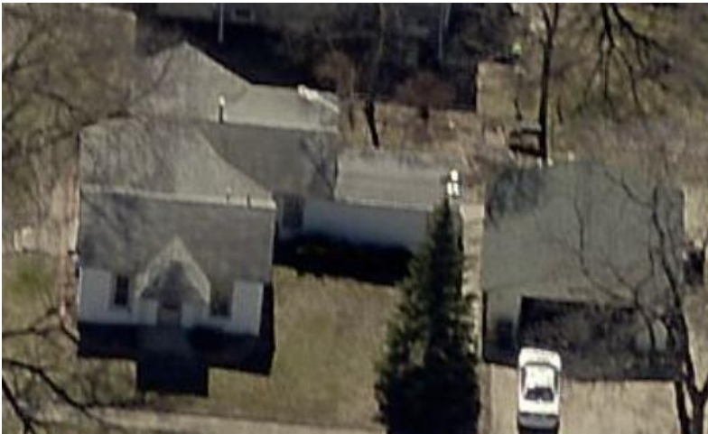
Photographs: 500 2nd St SW, looking south and west, Bremer Co. Assessor, Pictometry images 4/20/2013; and looking west, Bremer Co. Assessor.