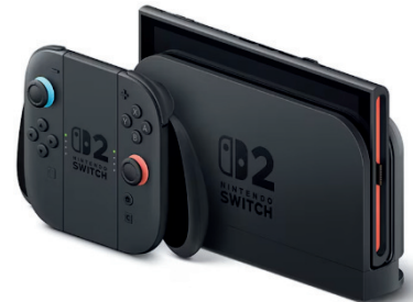
Nintendo Switch 2