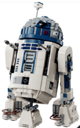
R2-D2 Lego Set