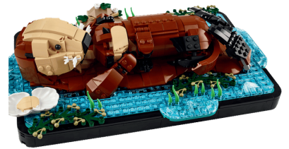
Otter Lego Set