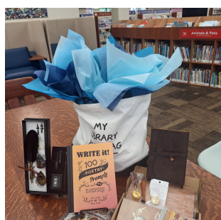
Stationary & Writing Hobby Bag