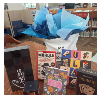
Puzzle & Game Hobby Bag