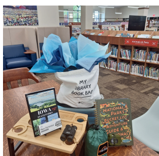
Outdoor Hobby Bag