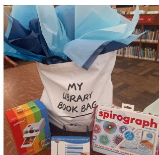
Nostalgic & Sensory Hobby Bag