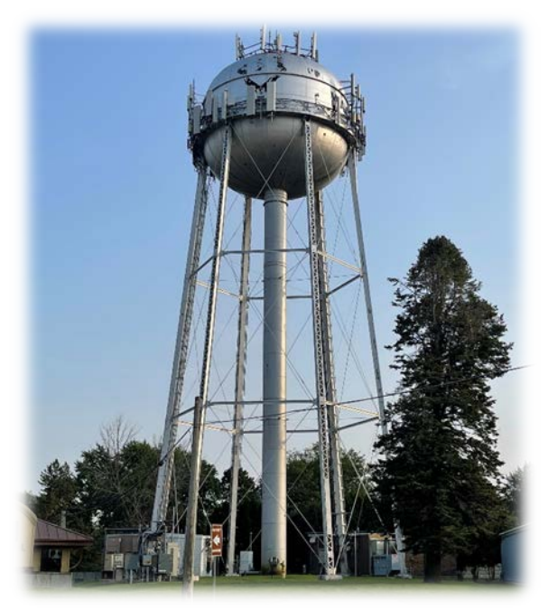
Waverly's West Water Tower was built by Pittsburg-Des Moines Steel Company in 1939.