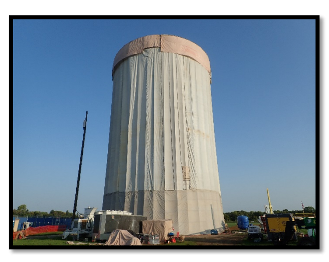
This is an example of the tarp system that will be used during the project.