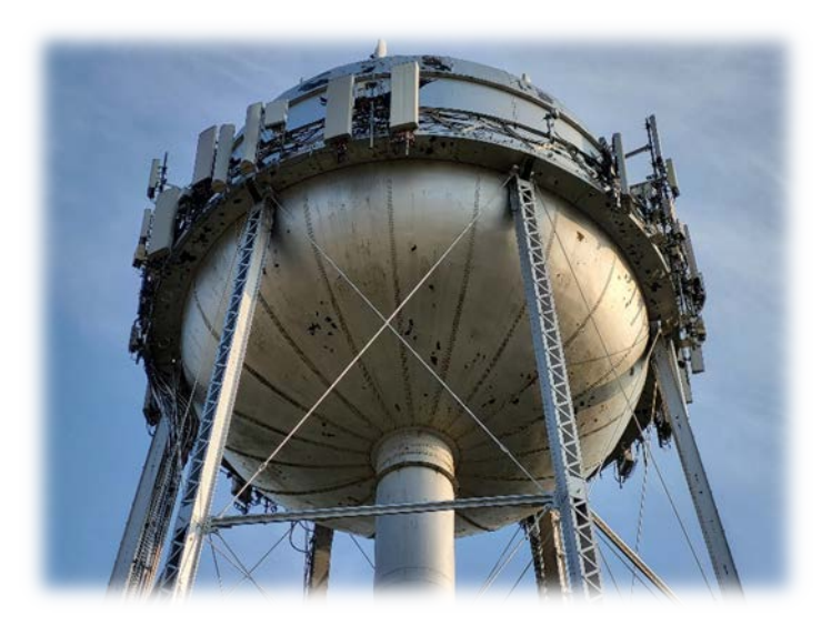
Coming soon!! A reconditioned West Water Tower that will continue to meet the needs of Waverly for years to come.