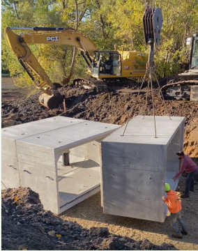
Box culvert after installation →

During the summer of 2022 the roadway will be rebuilt from Brown Lane to Horton Road.