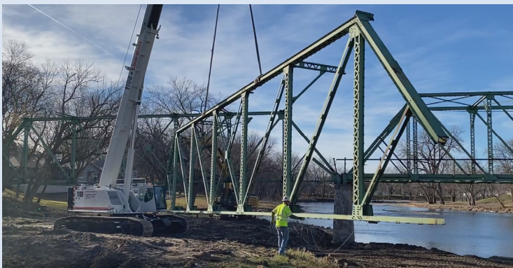
2021 Removing a Section of Bridge Truss