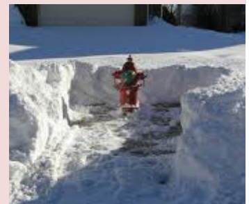
In the event of a fire, this hydrant is ready for use by the Waverly Municipal Fire Department.

Please consider adopting a hydrant near your house or business and clear the snow about four feet away from it after each snow event. With over 600 hydrants in Waverly, your assistance is greatly appreciated to help ensure a more rapid response by the Fire Department in the event of a fire during the winter.