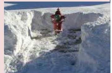
In the event of a fire, this hydrant is ready for use by the Waverly Municipal Fire Department.

Please consider adopting a hydrant near your house or business and clear the snow about four feet away from it after each snow event. With over 600 hydrants in Waverly, your assistance is greatly appreciated to help ensure a more rapid response by the Fire Department in the event of a fire during the winter.