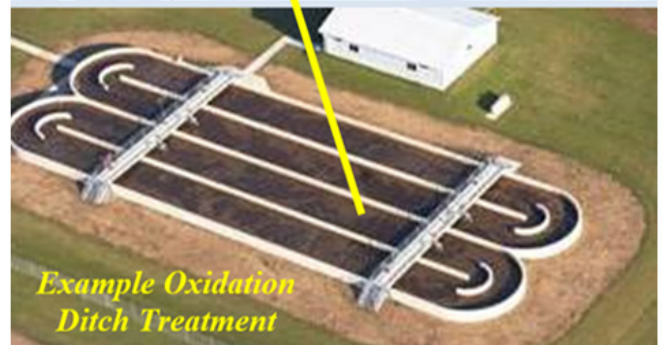
Example Oxidation Ditch Treatment