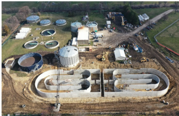
Progress on Waverly's WPC Facility Improvements