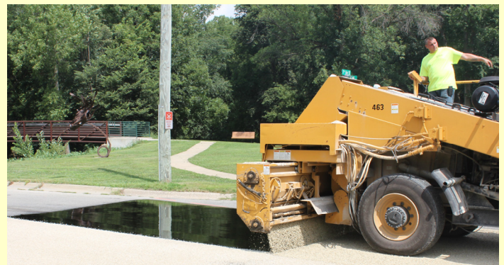
Contractor placing rock over oiled street. As soon as the rock has been placed on street, vehicles may drive slowly on the new surface.

Approximately 70 City blocks will be seal coated, with the majority of the work will occur on the north side of West Bremer Avenue. This project will be completed by mid-August.