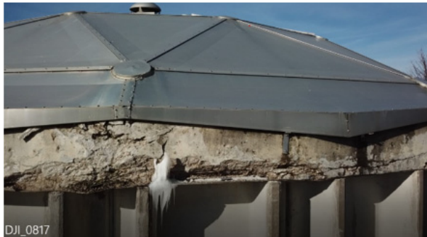
Trickling Filter Deterioration and Leakage

Waverly's WPC facility was placed in operation in 1980 and the trickling filter treatment system is nearing the end of its useful life. The existing trickling filter treatment process is not capable of achieving the total nitrogen and total phosphorus reduction goals set forth in the Iowa Department of Natural Resources (DNR) Nutrient Reduction Strategy. In order to achieve compliance with the Nutrient Reduction Strategy, the City's WPC facility will alter the treatment process with the construction of these oxidation ditches. These improvements will meet the treatment needs of our steadily growing population and serve the community for decades.