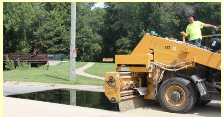
Contractor placing rock over oiled street. As soon as the rock has been placed on street, vehicles may drive slowly on the new surface.

The majority of the work will occur on the north side of Waverly. This project will be completed by mid-August.