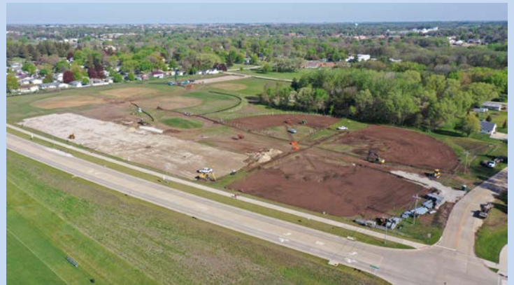
Cedar River Park Ballfield construction progress.

Phase 3 of the project could begin in late 2021 and is set to include the construction of facility buildings and an inclusive playground.