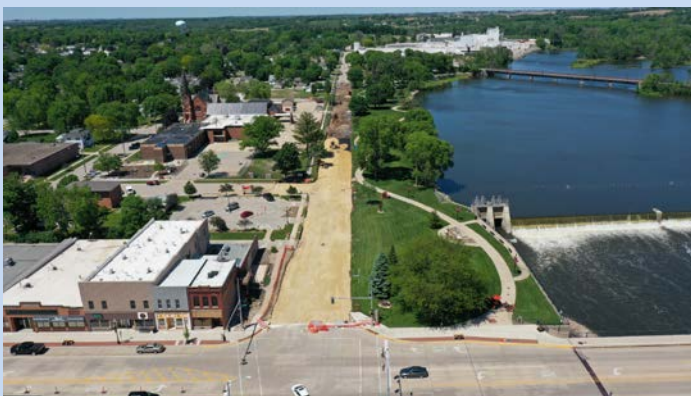
New aggregate subbase as viewed from Bremer Avenue.

The project involves new concrete pavement that is designed and built to withstand higher volumes of vehicle and truck traffic.