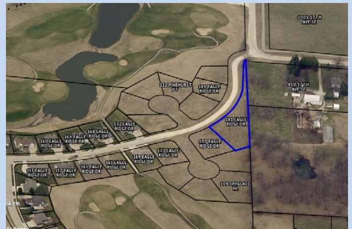
Undeveloped gravel section of Eagle Ridge Drive to be paved.

This project allows the City to pave the 750-foot graveled section of Eagle Ridge Drive to 8 th Street SE while vacating two small cul-de-sacs to be developed as private drives.