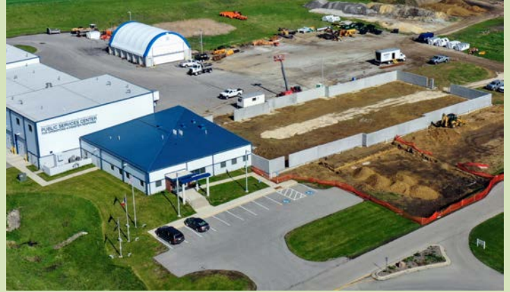
Contractor erecting the precast wall panels..

Construction of the addition should be complete by the end of the year.