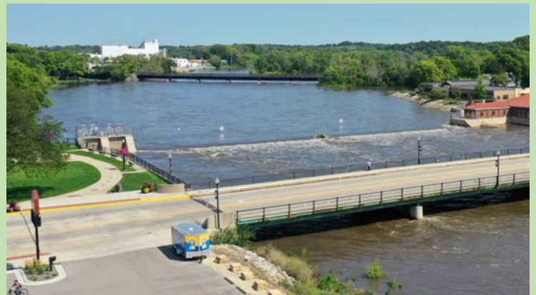
August 30, 2021 high-water event. Inflatable dam is fully deflated.