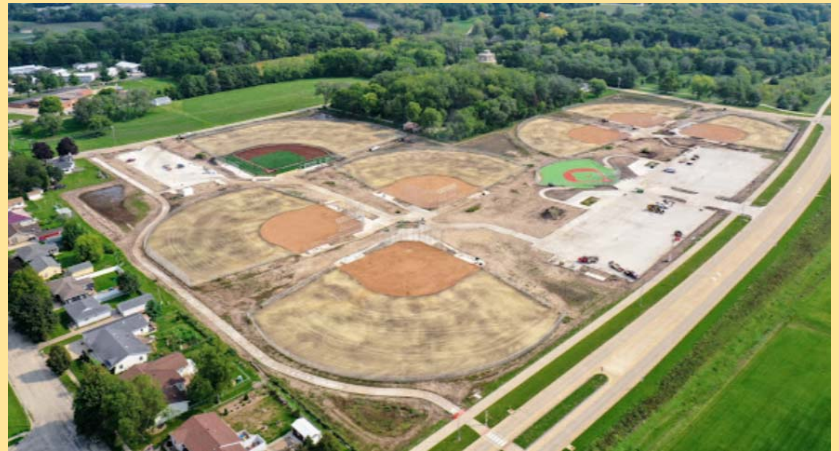
Cedar River Park ballfield construction progress.

The outfields have been seeded and the grass will need approximately 12 months to establish and mature before play can occur on the fields.