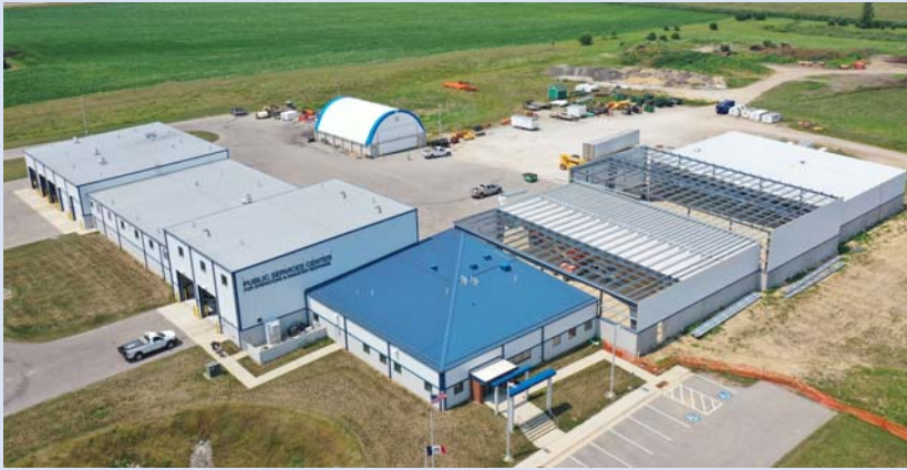
Construction progress at the Public Services Center.

Construction of the 21,230 square foot addition to the Public Services Center for Operations & Disaster Response is proceeding on schedule to be complete by the end of the year.