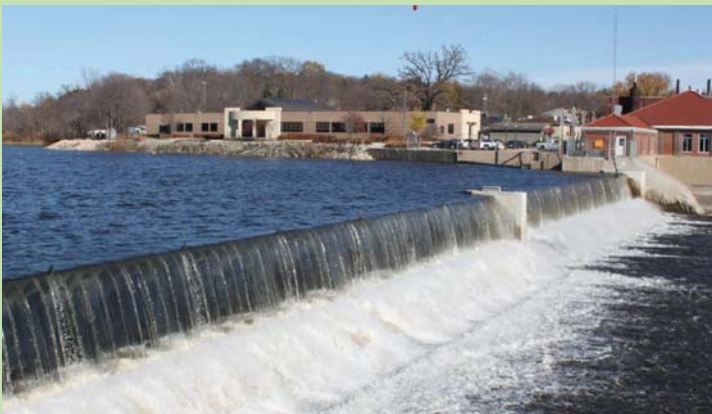
Fall 2011, Waverly Inflatable Dam is finished.

The Waverly Inflatable Dam was completed and dedicated on December 8, 2011. Since placed into operation, the dam has been fully deflated during the high-water events in May 2013, September 2016 and August 2021.