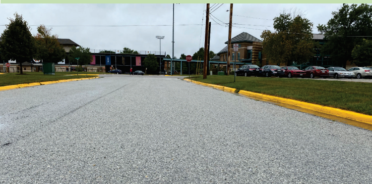
Wilson Avenue near Wartburg College

In prior years the aggregate source was the Platte Quarry near Tripoli where the rock is beige in color. This year the contractor obtained the seal coat chips from the Morgan Quarry in northeast Waterloo where the stone is a bluish-gray color. Work was started and completed in mid-July.