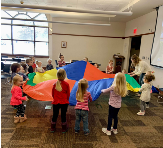
Storytime parachute games are always a favorite.