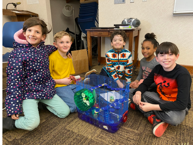
"Make your own board game" camp participants show off their game.