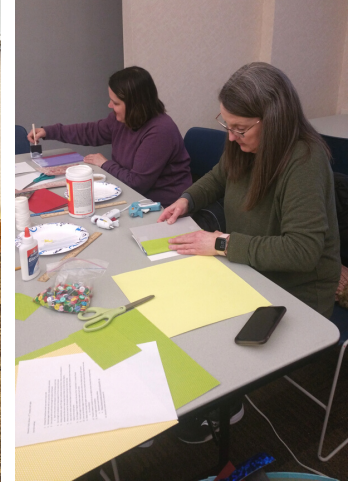
5th Tuesday craft night was a lot of fun!