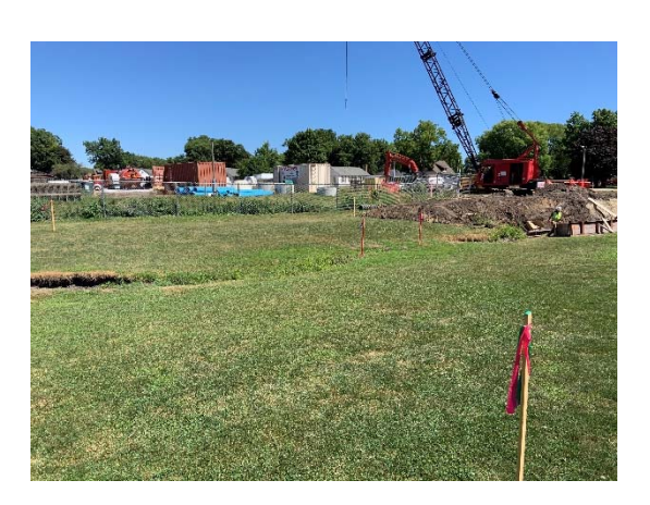
Hole #2 – David pointed out where the new Golf Course sign will be placed.