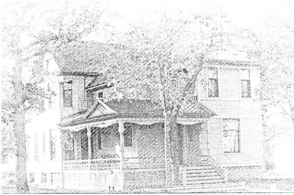
4 416 2nd St SE - Edward Smalley House