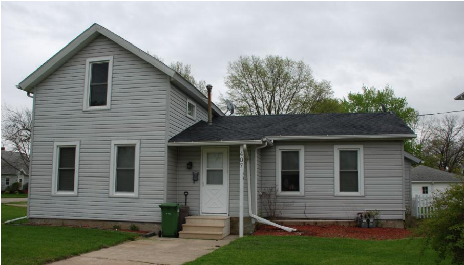
Photographs: 407 2nd St SW, looking east and southeast; rear looking southwest, 12/5/2013 and 4/2014, Andrew Bell, Svendsen Tyler, photographer.