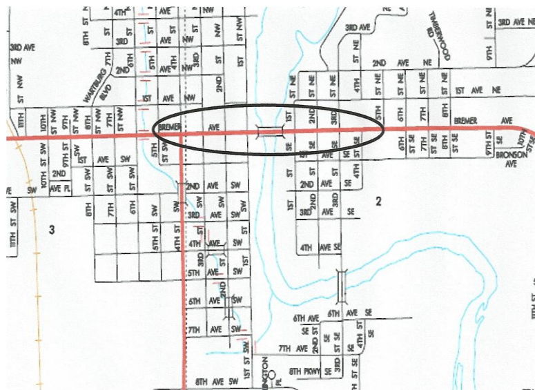
Overall central city with entire survey area circled. West side survey reported as HADB# 09-026.