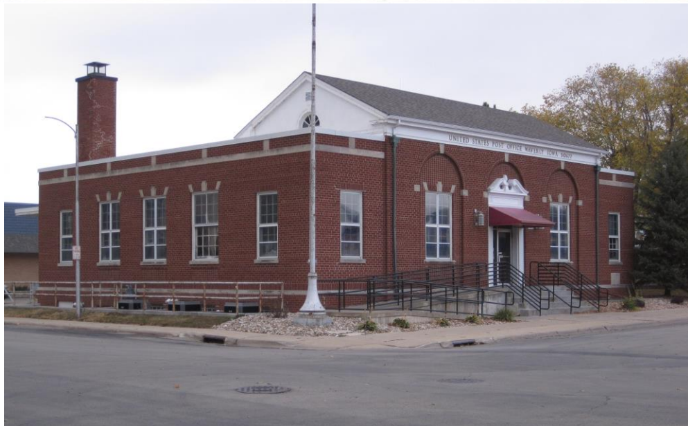
Historic Postcard, 1937 above; current photograph below.