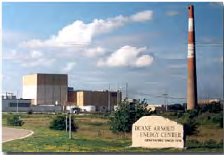
Figure 18: Picture of Duane Arnold Energy Center Near Palo, Iowa