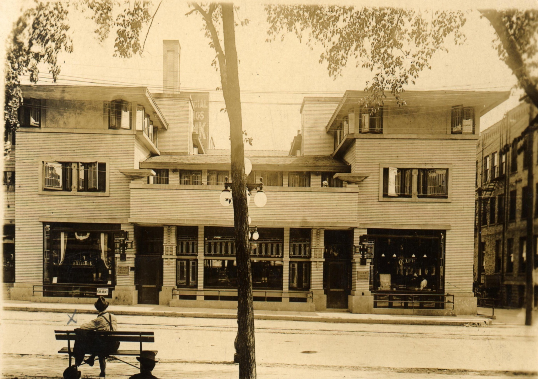
THE PARK INN MASON CITY IOWA