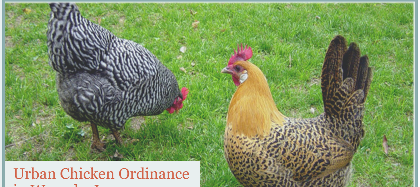
in Waverly, Iowa

Phone: 319-352-9208 Email: zoning@waverlvia.com