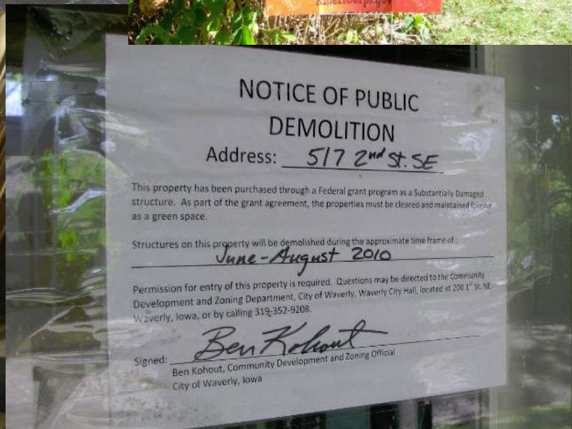
2010: Salvage by AmeriCorps and a sale by the Waverly HP Commission